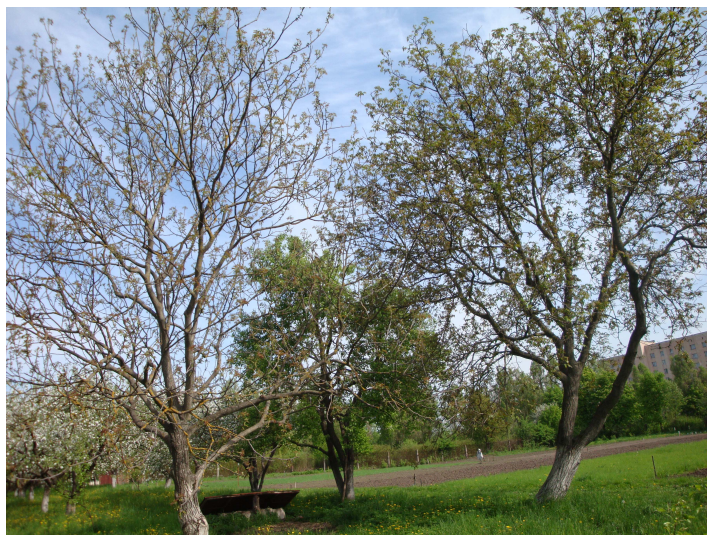
Picture 1. Protogenic (on the left) and protandrous (on the right) Juglans regia individuals in the period of flowering in the garden of agro biological laboratory of Ternopil teachers' training university named after Volodymyr Gnatuk (11. 05. 2011 year)

Our two years researches of this question are confirmed with literary data, because we observed constancy of dichogamy type in one and the same Juglans regia individuals. Despite changes of climatic conditions during the period of research male generative sphere of protandrous individuals and female of protogenic one always came first into phase of flowering (picture 1). Such appropriateness is also observed in the process of flowering. Data that we receive is confirmed by literary data about the fact that dichogamy is hereditary sign, peculiar to monoecious Circassian walnut. Change of climatic conditions influences only change of terms of beginning and duration of flowering of Juglans regia individuals.