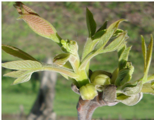
Picture 3 Female flowers of protogenic (a) and protandrous (b) J. regia individuals in the period of coming into the phase of blossoming (the 3 rd of May 2012 year)